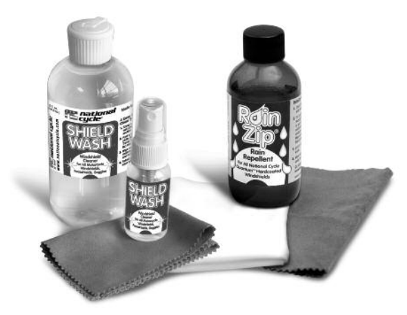
Ask for Shield Wash™ and RainZip® at your local dealer or visit www.nationalcvcle.com.